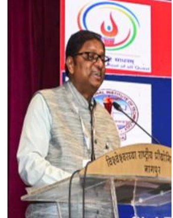
Coordinators of the Eight parallel tracks, presenting the gist of the discussion at the Open forum.