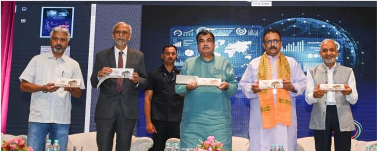
“Shiksha Sutra” was launched at the inaugural session of the conference.