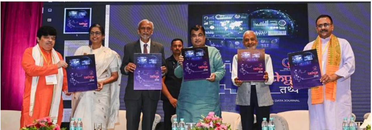
“Tathya”- A data Journal was launched at the inaugural session of the conference.